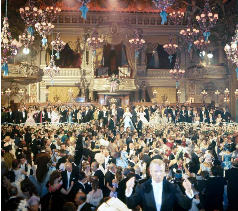
Bal du Second Empire, May 27, 1966