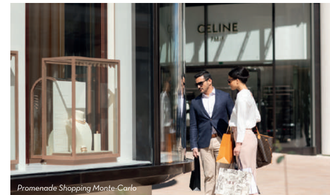
Promenade Shopping Monte-Carlo

Sixty luxury brands surround the Casino de Monte-Carlo in a parade of high-end fashion and jewellery. Along the route of the Grand Prix and the Monte-Carlo Shopping Promenade, an experience takes shape that is quite unlike any other on the Riviera.