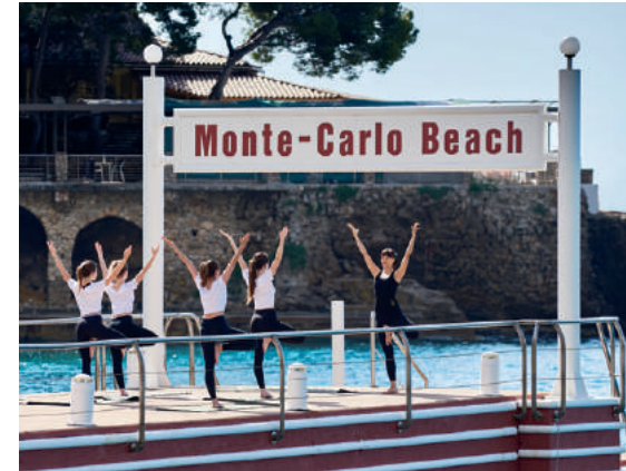
Yoga, Monte-Carlo Beach

The Wellness Sky Club unfurls towards the horizon atop the roof of the Hôtel de Paris Monte-Carlo, the age-old rituals of the Cinq Mondes spa at the Monte-Carlo Bay Hotel & Resort provide a sensory escape, and the Monte-Carlo Beach spa offers signature treatments and open-air yoga classes in perfect harmony with nature.