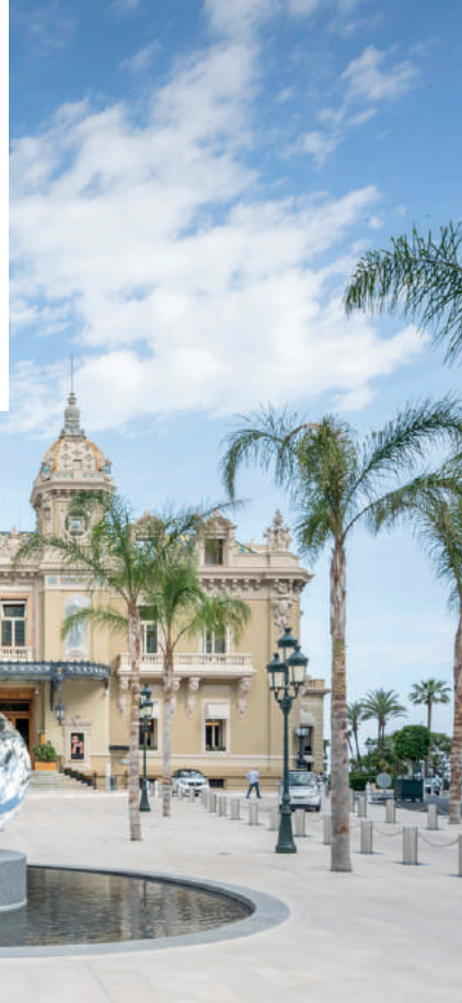
Casino de Monte-Carlo

The Monte-Carlo Société des Bains de Mer resort offers timelessly elegant luxury to suit modern tastes. Its palaces and restaurants provide the backdrop for prestigious events, and allow for the excitement of the lightening races to linger on into special moments. The rivalry of the Grand Prix heightens the pleasure of time spent shopping, pampering yourself, getting lost in the magic of Casino games, and discovering a new way to enjoy life in the One Monte-Carlo district. Luxurious sophistication in all its guises, and bespoke service.