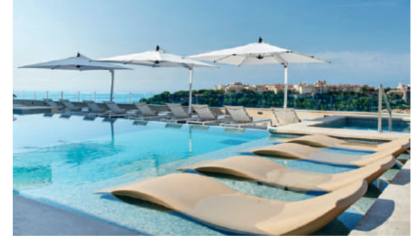
Wellness Sky Club, Hôtel de Paris Monte-Carlo

All our 4- and 5-star hotels offer you the chance to relax and enjoy the natural pleasure afforded by a spa. With links to the Hôtel de Paris Monte-Carlo and the Hôtel Hermitage Monte-Carlo, Thermes Marins Monte-Carlo offers beauty, shaping, and performance treatments.