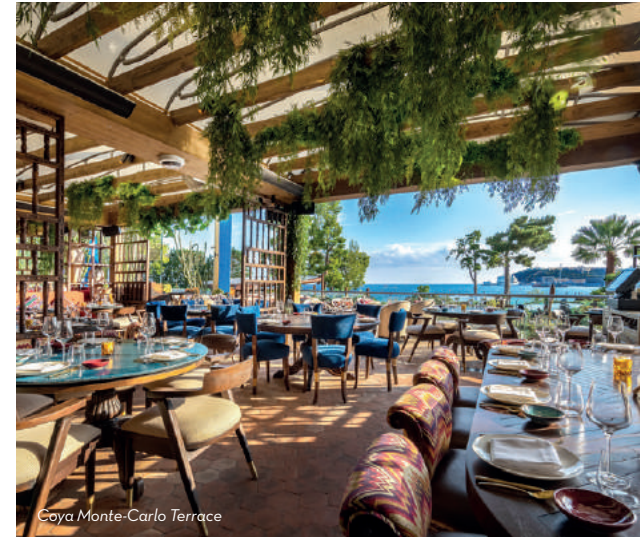
Coya Monte-Carlo Terrace

The Latin-American alchemy of COYA's Peruvian cuisine only serves to take the rivalry of the Grand Prix to new heights. With views out over the Mediterranean and a colorful atmosphere, COYA is definitely a place not to be missed.