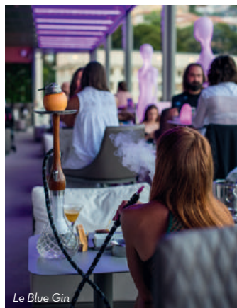
Le Blue Gin