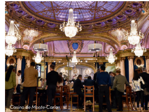
Casino de Monte-Carlo